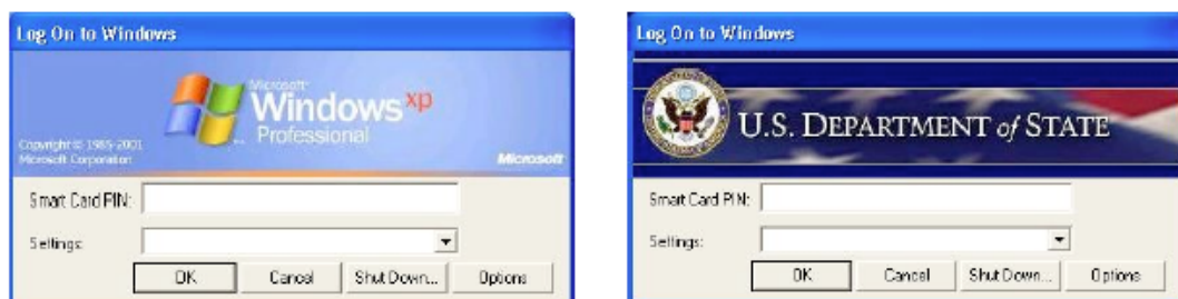
(a) Native Windows Login Panel

(4.1) When users' registration data are either transferred or entered into the IDMS server's database and users have downloaded and installed at their workstations SETECS ® OneCLOUD ™ Login module, they may start accessing the network or cloud in a secure way. Every day, when starting their sessions with the network or the cloud, users must first activate OneCLOUD ™ Login Client by double-clicking on its icon. The Client will display Login panel as shown in Figure 3 (a). The panel can be customized for individual agencies, shown in Figure 2 (b):